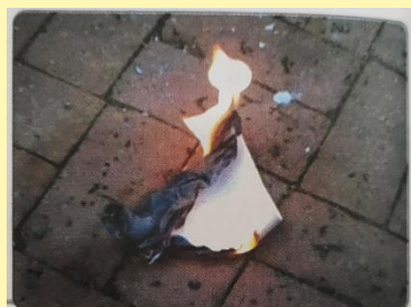
Burning of paper is